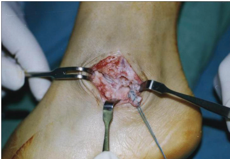
Figure 2: Peroperative photograph showing calcaneofibular ligament was advanced with the Bunnell suture technique. A short bony tunnel along the original calcaneofibular ligament axis was created from the fibular attachment of the calcaneofibular ligament using the 2.0-mm, 3.0-mm, and 4.0-mm drill bits

The ankle was immobilized with the posterior splint for 2 weeks and maintained in a nonweight bearing position. After removal of the wound dressing and sutures, a short leg-walking splint was applied, and active range of motion exercises were performed for the treated ankle for another 4 weeks. At 6 weeks postoperatively, the walking splint was removed and the ankle was protected by a soft orthosis. Physiotherapy, including proprioceptive training, progressive strengthening, and flexibility exercises were then initiated. Three months postoperatively, patients were allowed to practice straight line running and gentle jogging with a soft brace. Patients were allowed to participate in a full range of sports activities by 6 months postoperatively; however, the use of an ankle support during heavy exercise, such as while playing basketball or tennis, was advised for an additional 6 months.