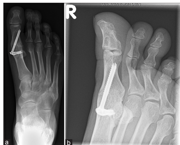
Figure 3: X-ray of foot anteroposterior and oblique views (a and b) showing final assessment of a patient with hallux rigidus treated with an intraosseous implant