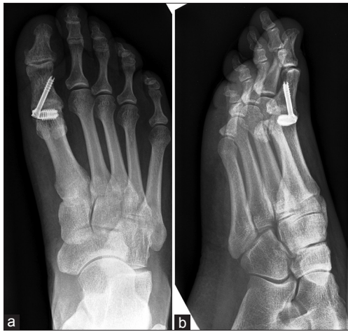
Figure 4: X-ray of foot anteroposterior and oblique views (a and b) showing fusion of metatarsophalangeal joint at final assessment of a patient treated with an intraosseous implant

described including crossed screws and plates. Patient satisfaction is highly correlated to the final alignment and compression across the fusion area. 8,9 The recommended HVA ranges from 5° to 30° with an average of 15°. 10,11 In the sagittal plane, the recommended DA for the arthrodesis varies from 10° to 40° with 20–25° being the most commonly recommended position. 1 Most common occurring complications include nonunion, malalignment, and hardware impingement of the soft tissues. 5,6,12 Therefore, every technique should enable the surgeon to fuse the joint in the desired position using rigid internal fixation devices.