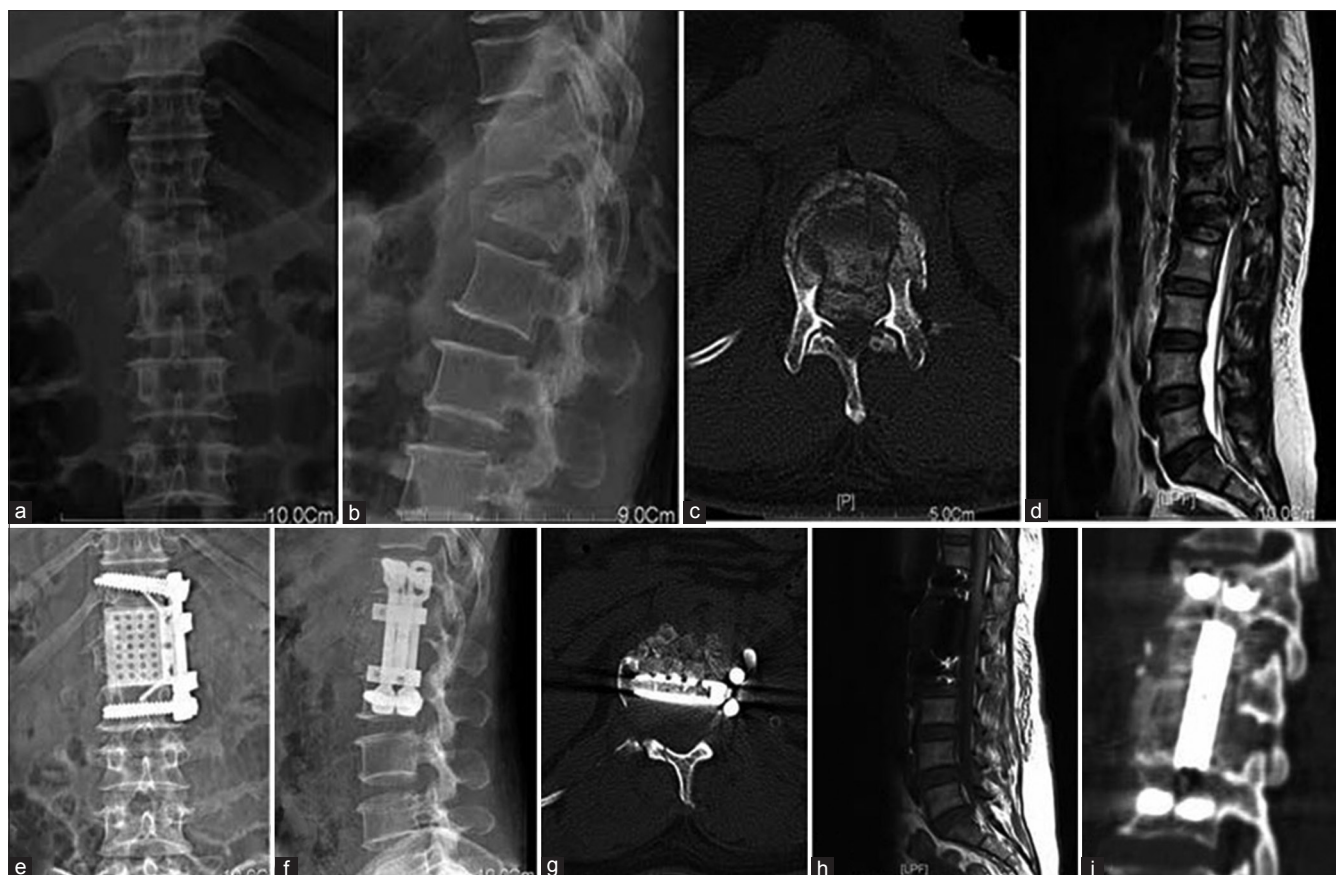
Figure 3: X-ray of dorsolumbar spine anteroposterior (a) and lateral (b) views showing an L1 burst fracture and kyphosis (c) Axial CT scan showing retropulsed fragment of L1 burst fracture (d) T2W mid sagittal MRI of dorsolumbar spine showing L1 burst fracture and spinal canal compression (e and f) X-ray anteroposterior and lateral views showing cage and implant in situ (g) Axial CT scan showing decompression and implant in situ (h) T1W mid sagittal MRI showing decompression (i) Reconstructed CT image at burst level showing adjacent vertebral bodies, cage and implant

bone implant inside the cage but also in front of the cage. In the current study, the amount of bone implantation in the burst vertebral body and adjacent disc spaces was larger. This was considered to be safe as the gate-like design could help avoid grafted bone dropping into spinal canal. Solid fusion was supposed to occur both inside and outside the rectangular cage, which would provide better fusion effect observed in the selective corpectomy.