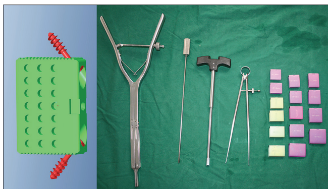
Figure 1: Photograph showing different sizes of U-cage for reconstructing fractured vertebral bodies along with instrumentation

All patients were placed right-side down to avoid retracting the liver and injuring the inferior vena cava. A retroperitoneal approach was used. The affected vertebra and two neighboring vertebrae were carefully exposed, and the segmental vessels of these three vertebrae were subsequently ligated. The intervertebral disk and cartilage above and below the injury level were removed while preserving the bony endplate. A slot on the posterior third of the vertebral body was made with an osteotome and hammer to decompress the spinal canal and create a space to place the U-cage, which eliminated the need to perform corpectomy [Figure 2]. A special distractor was used for reduction, and a gauge for measuring the length between the cephalad and caudal endplates was used to choose an appropriately sized U-cage. Cancellous bone harvested from the fractured vertebral body or resected ribs was packed inside the device. After confirming appropriate cage placement, two 3.5 mm cortical screws were fixed into the endplates to prevent further displacement and subsidence of the cage. Cancellous bone also filled into the space of the two intervertebral spaces and in front of the U-cage. Allogeneic cancellous bone was also applied if there was not enough bone for implantation. The low-profile anterior