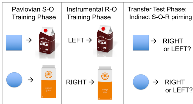
Fig. 2 Classic Pavlovian-to-instrumental transfer paradigm. The integration of separately learned S-O and O-R associations are examined in a test phase in which the Pavlovian stimuli are presented and response choice measured. Indirect O-R priming (PIT) occurs when anticipation of the chocolate milk (generated by the square stimulus) causes participants to push more on the left (chocolate-milk-yielding) key

the motivating (and inhibitory) effects of Pavlovian cues on ongoing appetitive (and avoidance) responses towards either monetary or chocolate rewards (in humans; Colagiuri & Lovibond, 2015; Garbusow et al., 2015; Garofalo & di Pellegrino, 2015; Guitart-Masip et al., 2011; Lovibond & Colagiuri, 2013; Talmi, Seymour, Dayan, & Dolan, 2008). However, because these studies only included one instrumental response, it is unclear whether the facilitatory effect observed is a specific O-R priming effect or whether the Pavlovian cues boosted the motor system generally, and thereby increased overall response vigour (an effect known as ‘general PIT’; Chiu, Cools, & Aron, 2014; Corbit & Balleine, 2005; Corbit, Janak, & Balleine, 2007; Holland, 2004). We know that this general effect can occur from elegant studies that disentangle specific and general PIT effects. For example, Corbit and Balleine (2005) showed within a single paradigm that Pavlovian stimuli for instrumental outcomes (CS1-O1 and CS2-O2) would specifically enhance performance of responses that previously led to those outcomes (R1-O1 and R2-O2), while a CS for a third noninstrumental outcome led to increased performance of both (R1 and R2) responses relative to baseline. The general motivating effect of Pavlovian cues on ongoing response behaviour is reduced if the general outcome is not currently desired (Corbit et al., 2007; Watson et al., 2014).