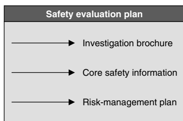
Fig. 3. Key safety documents derived from the safety evaluation plan.

Alternatively, if contacts with regulatory authorities have suggested an area of concern, prior planning can help the sponsor present data and analyses that put off the need for a formal RMP. Tracking the issue through the SEP ensures it receives appropriate attention.