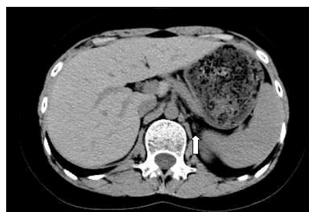
Fig. 2 Computerized tomography (CT) of abdomen of II-2. CT revealed small adrenal glands as indicated by the arrow.

The patients' father (I-1) and mother (I-2) had both undergone normal puberty without any symptoms of adrenal insufficiency.