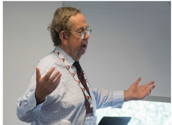
Fig. 2 Presentation at the International Association for Bridge and Structural Engineering—Symposium (IABSE) in Nantes in 2018.