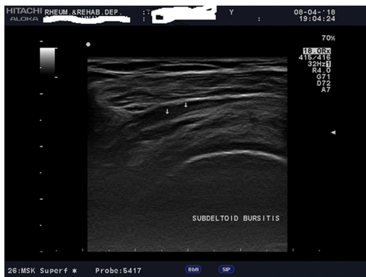
Fig. 4 Left subdeltoid bursitis. Longitudinal view of the left rotator cuff of the left shoulder joint. arrows showed hypoechoic area inside the subdeltoid bursa (synovial hypertrophy)

also, we still agree regarding the findings with many studies like the study done by Elbinoune et al. [14] in which they evaluated 37 RA patients with painful and painless shoulder joints and found that SASD bursitis was present in 37.8% of the patient’s shoulders; another study agreed with us which was done by Stegbauer et al. [10] on painful shoulders in 99 RA patients, and they found that SASD bursitis was present in (35%) of the shoulders; also another study on painful shoulders in 44