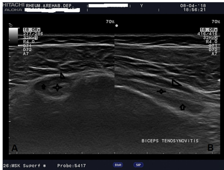
Fig. 3 Right biceptal tenosynovitis. a Longitudinal view. b Transverse view of the right long head of biceps tendon of the right shoulder joint. Asterisks showed the tendon fibers, arrows showed synovial hypertrophy, and arrow heads showed effusion around the tendon inside its synovial sheath

was present in 45% of the shoulders, although this study was done on active painful shoulders only. As regards the SASD bursitis, we found that 31.78% of our patient’s shoulders showed SASD bursitis with 16.87% effusion and 15% synovial hypertrophy, and also this is higher than the percentage of SASD bursitis present in the normal population in Iganocci et al.’s study [11], in which they found that SASD bursitis effusion was present in 11.3% and synovial hypertrophy was present in 2.1%. But