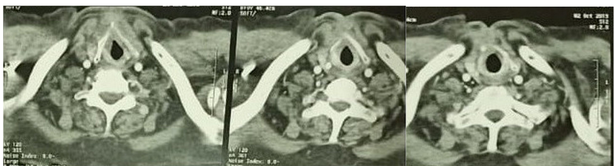
Fig. 3 Postoperative CT neck

There are no strict recommendations for carrying out large neck operations under RA, but, RA may be optimal in those with a high risk of GA, pulmonary dysfunction, prior cardiac infarctions, patients needing urgent laryngectomy, those preferring local to general anesthesia, and patients whose surgeons favor RA. Hochmann and