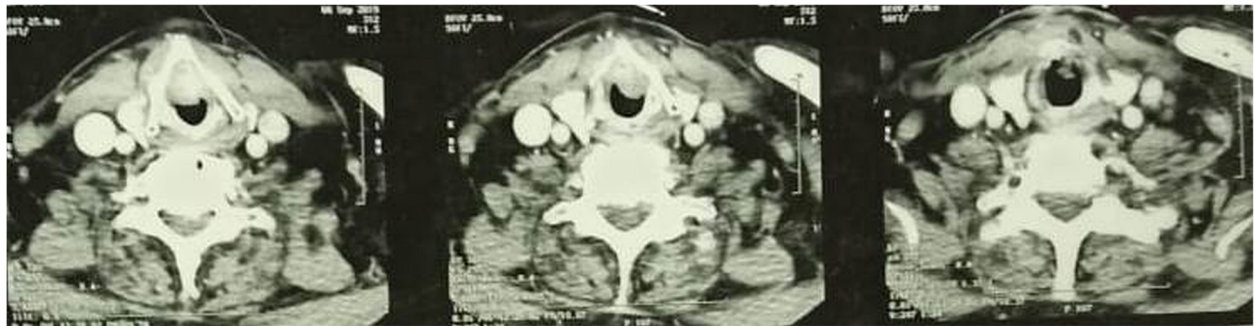
Fig. 2 Preoperative CT neck

of 3 l/min through tracheostomy with no need for adjuvant anesthesia or analgesia; as surgery ends, the patient is discharged to the recovery room for follow-up. The postoperative period was uneventful with no nausea or vomiting, and the need for postoperative analgesia was approximately after 6 h following the surgery which was achieved with a combination of ketorolac and paracetamol.