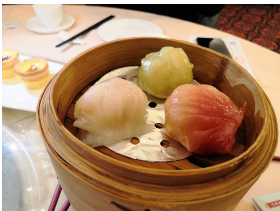
Fig. 1 Shrimp dumpling: have a history of a hundred year. They are filled with fresh shrimps, pork, bamboo shoots, etc. The skins of the shrimp dumpling incorporate various colors

Sticky rice chicken (糯米鸡) (Fig. 2) is another popular and representative Dim Dum dish with a sticky, moist, and rich texture. Sticky rice, chicken, fork-roast meat, spareribs, salted egg yolk, and mushrooms are wrapped