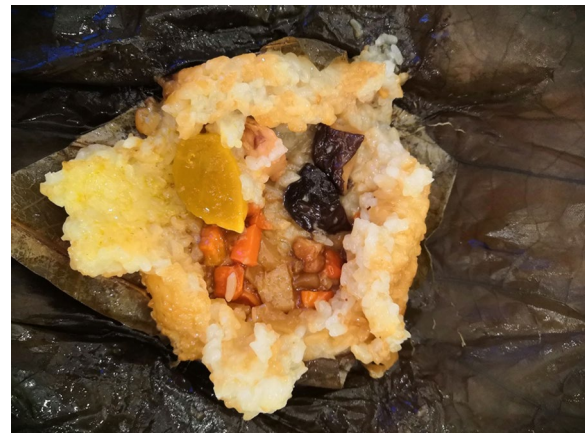
Fig. 2 Glutinous rice chicken: glutinous rice wrapped in a lotus leaf that typically contains egg yolk, dried scallop, mushroom, and meat (usually pork and chicken)

by lotus leaves. During steaming, rice is soaked in the unique aroma and flavor of the lotus leaf, generating the distinctive fragrance of the dish.