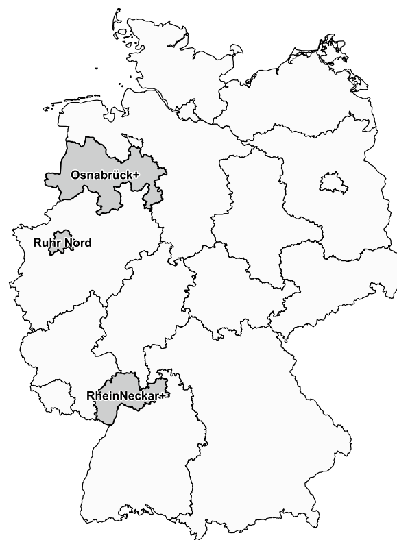
Fig. 1 Geographical location of the surveyed networks within Germany

For quality assurance and following recommendations from the Dutch ParkinsonNet [8], all networks were initiated by PD experts who are renown and connected in the scene. All three regions differ from one another as they do have different care structures and HCP densities. The predefined network regions consist of different types of cities and municipalities and therefore have different levels of differentiated infrastructure. The PNRN+ is