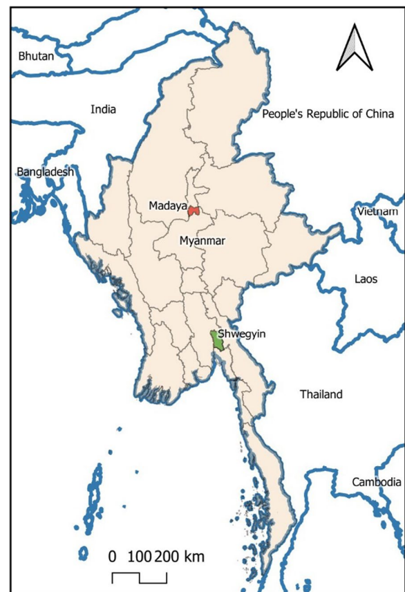
Fig. 1 Map of Myanmar with study sites; Shwe Kyin in Bago Region and Madaya in Mandalay Region

The Department of Medical Research (DMR) and the NMCP under the Ministry of Health in Myanmar co-led the fieldwork for this study. Thus, this study demonstrated the collaborative effort of different departments, with the integration of three national programs through midwives to detect malaria, anemia, STH and HIV in rural settings in Myanmar.