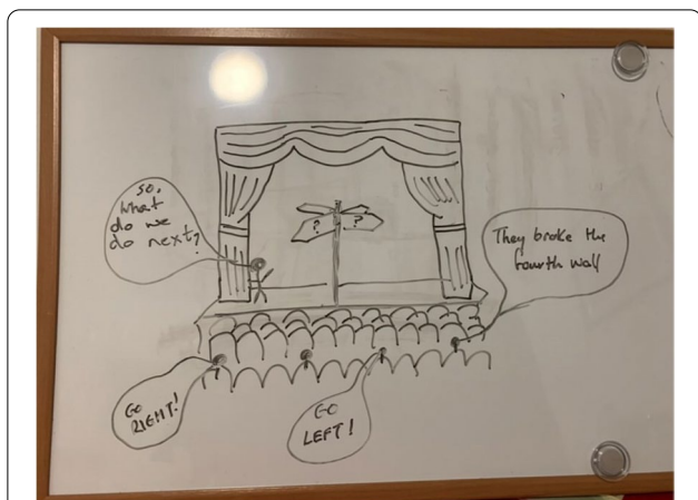
Fig. 1 Illustration of a qualitative interview elicitation rich picture by “Phillip”*. *All names included in this paper are pseudonyms

Research interviews were recorded using digital dictaphones, transcribed verbatim, checked for accuracy and anonymised using pseudonyms.