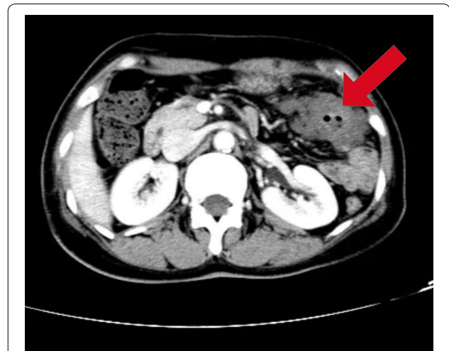
Fig. 3 Computer tomography image obtained from a 53-year-old female patient with a mucinous colorectal adenocarcinoma (5.5 × 3.0 × 2.5 cm) located in the transverse colon 55 cm from the anus. No significant enhancement compared with normal muscle in the arterial phase was observed. The patient was diagnosed as mucinous colorectal adenocarcinoma staged T4N2M1 with liver and abdominal metastases. She received 3 cycles of XELOX (capecitabine plus oxaliplatin) chemotherapy, a palliative surgery, 5 cycles of XELOX chemotherapy, and capecitabine maintenance therapy for 5 months till present

Multiple clinical trials have been performed to evaluate the prognostic value of mucinous colorectal adenocarcinoma histology. Although mucinous colorectal adenocarcinoma is different from non-mucinous colorectal adenocarcinoma in terms of gene expression and histology, the standard treatments for colorectal adenocarcinoma are recommended to mucinous colorectal adenocarcinoma patients since no clinical guidelines have been developed specifically for this group of patients. It was reported that patients with mucinous colorectal adenocarcinoma was less responsive to neoadjuvant and adjuvant chemotherapy as compared to those with non-mucinous colorectal adenocarcinoma, due to the mucinous colorectal adenocarcinoma histology