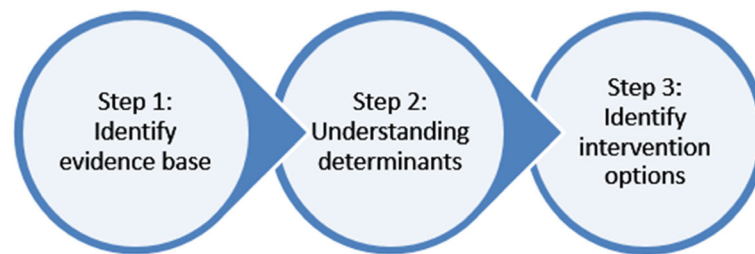
Fig. 1 Systematic step-wise intervention development process

Intervention development involved four key steps with the procedure for these steps outlined below.