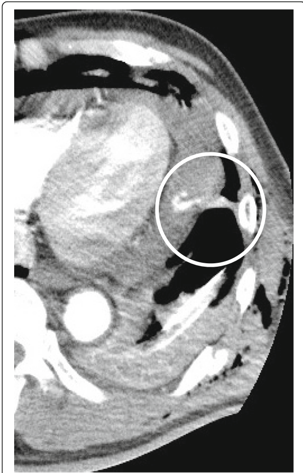
Fig. 3 Dynamic CT scan finding at 10 h after admission. Dynamic CT scan showed active bleeding in the pericardium (circles)

the patient was forced to carry out long-term bed rest. On day 41, he was discharged wearing a corset.