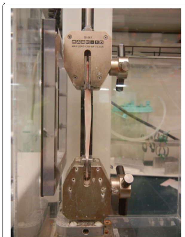
Figure 1 Mark-10 force measurement system.

Pre-injection tendon weight did not significantly differ among the three groups as determined by one-way ANOVA ( F(2,15) = 0.75 , p = 0.49 ). The post-injection weight of the tendons in the PRP-MB group increased by an average of 0.22 \pm 0.03 g (Table 1). Based on the measured density of this fluid (1.40 g/mL), this correlates to an average of 62.7% of the 0.25 mL injectant retained per tendon in this group. The post-injection weights of the MB tendons increased