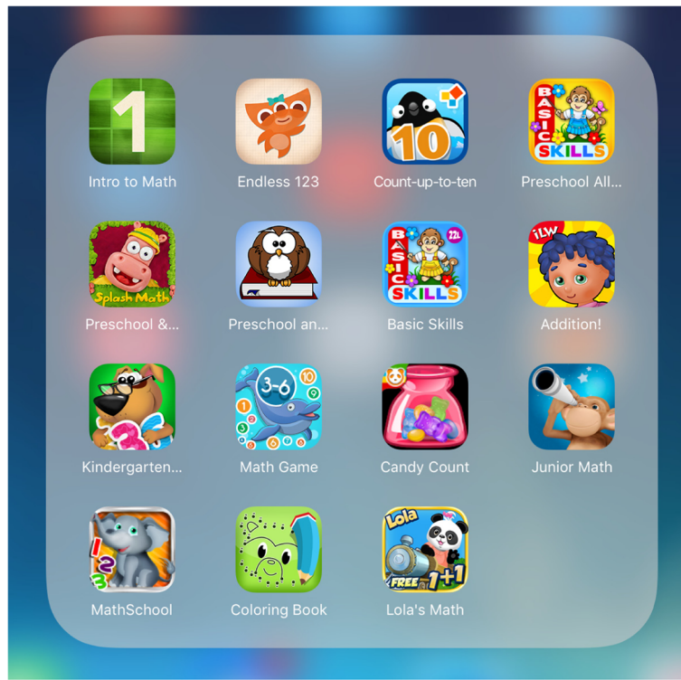
Fig. 1 Apps used in study