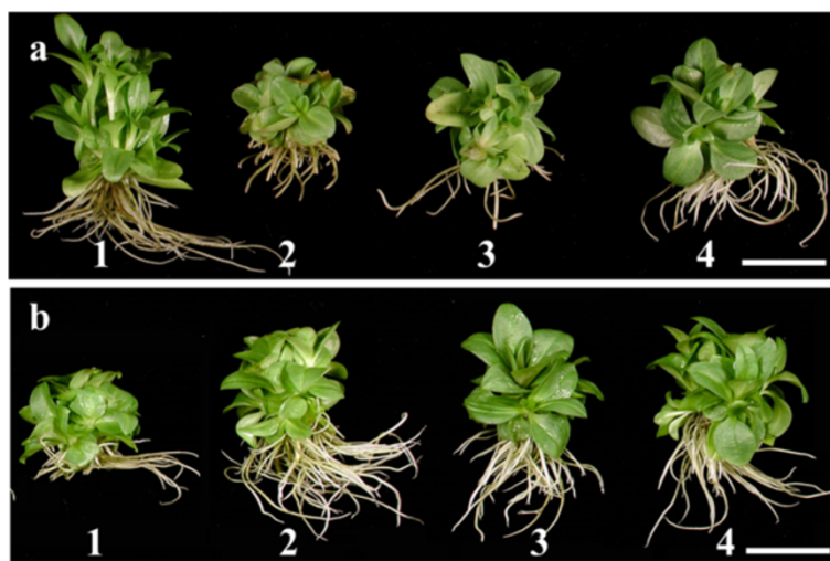
Figure. 2 Influence of ventilation closures on root/shoot growth in G. scabra Bunge (a) One-stage ventilation closure: (1) 2AF8wk-2 layers of aluminum foil (AF) and incubation for 8 weeks, (2) 2DP8wk-2 layers of dispense papers (DP) for 8 weeks, (3) 3DP8wk-3 layers of DP for 8 weeks, (4) 4DP8wk-4 layers of DP for 8 weeks, (b) Two-stage ventilation closure: (1) 2AF1wk/4DP7wk-2 layers of AF for one week then AF replaced by 4 DP for the next 7 weeks, (2) 2AF2wk/4DP6wk-2 layers of AF for 2 weeks then AF replaced by 4 DP for the next 6 weeks, (3) 2AF3wk/4DP5wk-2 layers of AF for 3 weeks then AF replaced by 4 DP for the next 5 weeks, and (4) 2AF4wk/4DP4-2 layers of AF for 4 weeks then AF replaced by 4 DP for the next 4 weeks. Scale bar = 2 cm

Between the two sets of ventilation closure treatments, i.e. one-stage and two-stage with a total incubation period of 8 weeks, overall, all the root/shoot growth parameters including the plant survival percentage were higher with two-stage ventilation closure treatments (Table 1). There were significant differences in root/shoot growth parameters among the treatments within the one-stage, and two-stage ventilation closures itself (Figure 2 a1-4 and b1-4).