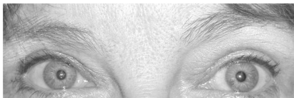
Figure 4 Patient 2. Asymmetries: MPD = 0 mm; CED = 5.5 mm; NED = 6 mm; TED = 3.5 mm.

0.66), 1.34 mm (95% CI 1.14-1.54), 1.78 mm (95% CI 1.49-2.07), and 1.77 mm (95% CI 1.46-2.07), respectively.