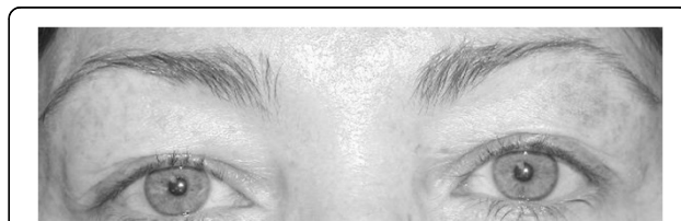
Figure 3 Patient 1. Asymmetries: MPD = 0 mm; CED = 1.5 mm; NED = 1.5 mm; TED = 4 mm.

Figure 2 reports the average asymmetry, in millimeters, for each of the four measurements. The average MPD, NED, TED and CED were 0.55 mm (95% CI 0.44-