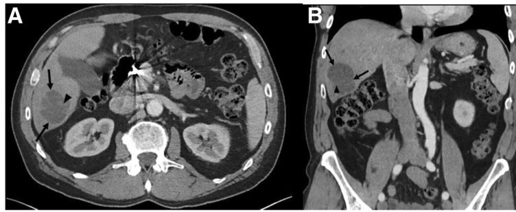
Fig. 2 a Axial and b coronal post-contrast CT images through the abdomen approximately 3 months status post Yttrium-90 radioembolization and after the start of evofosfamide clinical trial demonstrate the index metastatic lesion (arrows) within the right hepatic lobe with expected post-treatment changes and internal areas of hemorrhage (arrow heads), however without a significant decrease in size

mutation rates, for example those found in melanoma and non-small cell lung cancer. While in comparison the mutation rate in acute leukemia is low. The genetic aberrations involved in the development of angiosarcoma are still poorly understood. Until recently, most of the genetic alterations were identified mostly in secondary but not in primary angiosarcomas. The most frequent chromosomal abnormalities were on chromosome 8q, 10p and 5q [9]. Additionally, MYC amplification is a recurrent genetic mutation in secondary angiosarcoma. Recently, Shon and his colleagues confirmed the presence of both MYC amplification and MYC overexpression in a minority of primary angiosarcomas [10]. In their study, by IHC analysis, MYC overexpression was present in 9 of 38 (24%) cases. Six of the nine positive cases were from the head and neck region [10]. Therefore, in comparison to other tumor types, angiosarcoma would appear to have an intermediate mutation frequency.