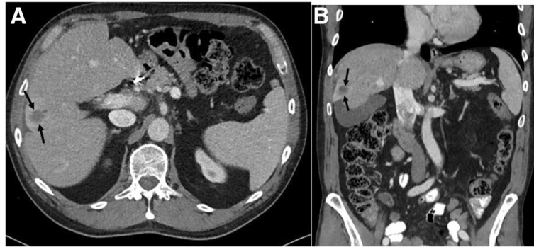
Fig. 4 a Axial and b coronal post-contrast CT images through the abdomen after completing 13 cycles of immunotherapy and despite being off treatment for 4 months secondary to hepatitis again demonstrate the index metastatic lesion (arrows) within the right hepatic lobe with continuing decrease in size

suggesting that the use of PD-1 and PD-L1 blockade does show efficacy in the treatment of sarcomas and may provide a viable treatment option for patients [14]. Another retrospective analysis included 23 metastatic soft tissue sarcoma or bone sarcoma patients treated with nivolumab [15]. Thirteen of these patients also received concomitant treatment with the tyrosine kinase inhibitor, pazopanib. Patients had baseline imaging and then restaging imaging after 6 cycles of treatment and 9/23 patients were found to have clinical benefit, with either a partial response or stable disease [15].