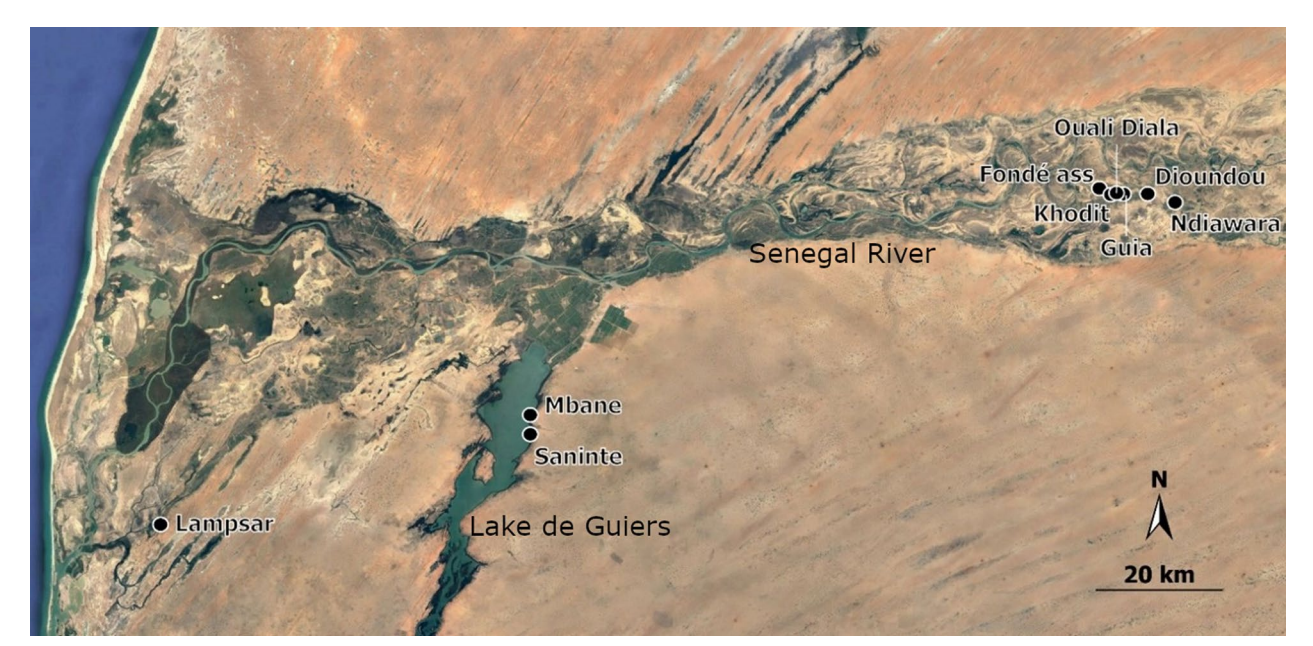
Fig. 1 Satellite map of the studied area in Northern Senegal. This map indicates the location of the nine targeted sites (black dots) and the name of the nearby nine villages associated to these Schistosoma haematobium transmission sites

The transmission sites close to the villages of Ndiawara (16^{\circ}35'04''N / 14^{\circ}50'58''W) , Ouali Diala (16^{\circ}35'56''N / 14^{\circ}56'10''W) , Dioundou (16^{\circ}35'50''N / 14^{\circ}53'22''W) , Fonde Ass (16^{\circ}36'20''N / 14^{\circ}57'38''W) and Khodit