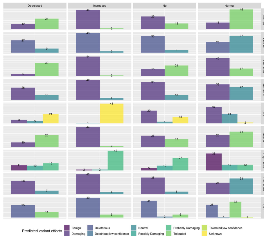
Fig. 3 Classification of the variants included in our training set as based on broadly used in silico prediction tools. The columns show each functionality class (“decreased,” “increased,” “no,” and “normal”) and each row shows the distribution of variants within each class according to the predicted variant effect, as assigned per each in silico prediction tool. Predefined cut-off values for classification (as used in VEP and dbNSFP) are implemented. The scores are derived from ClinPred, Condel, FATHMM, fathmm.XF, LRT, MetaLR, Polyphen-2, PROVEAN, and SIFT

diagnosed with psychiatric disorders. Interestingly, 343 variants were identified, covering 10 pharmacogenes ( DPYD , CYP2C19 , CYP2C9 , CYP2C8 , SLCO1B1 , NUDT15 , CYP2B6 , UGT1A1 , CYP2D6 , TPMT ), 18 of which were attributed a SO consequence indicative of LoF variants. More specifically, we found 11 “frameshift,” 6 “stop gained,” and 1 “start lost” variants. None of these variants was assessed by the RF model, owing to the high levels of missing values (mean, 77% missing values in the scores of interest). The remaining variants were mostly missense ( N = 205 ) or synonymous ( N = 107 ) (Figure S3). According to GnomAD genome frequencies in the general population (AF), which were available for 88 of these variants, the dataset was enriched for “ultra-rare” variants ( MAF \leq 0.1\% ) ( N = 42 ), followed by “rare” ( 0.1\% \leq MAF < 1\% ) ( N = 18 ), “low frequency” ( 1\% \leq MAF < 5\% ) ( N = 14 ), “common” ( MAF \geq 10\% ) ( N = 8 ), and “intermediate” ( 5\% \leq MAF < 10\% ) ( N = 6 ) variants.