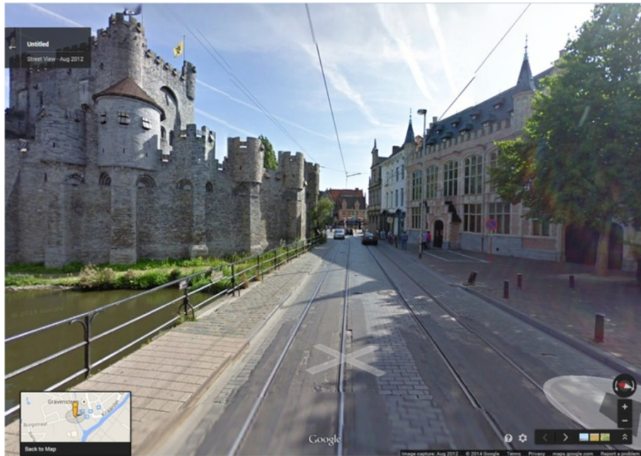
Figure 2 Example of Street View image.

Street View imagery is captured through a diverse fleet of vehicles equipped with specialist cameras (Vincent 2007). After collection, photos are digitally processed and 'stitched' together to obtain the familiar 360° panoramas. These images are connected to the Google Maps map and embedded with information on the street name and the approximate address. To protect the privacy of bystanders that are inadvertently captured on camera, faces and license plates are pixelated (Google 2014h). Users can make additional requests for blurring out images that feature the user, their family, their home or their car, and have tools available to request the removal of inappropriate or sensitive images.