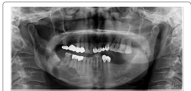
Fig. 2 Multilocular radiolucency extending from tooth #45 to the right ascending ramus, with impaction of tooth #48 in a 59-year-old woman. The lesion was diagnosed as a keratocysticodontogenic tumor by histopathologic examination