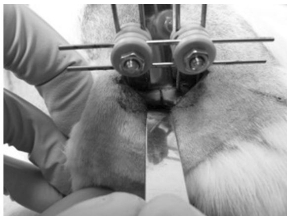
Fig. 1 Lateral view onto the left hind limb of the rat with osteotomy and external fixateur placed in the femur

The reduction maneuver was performed according to the previous published study [9]. In brief, an industrial robot (Stäubli RX 90, Stäubli Tec System, Faverges, France) with its standard robot control unit (CS7B) was used for the reduction procedure. The robot was controlled with a