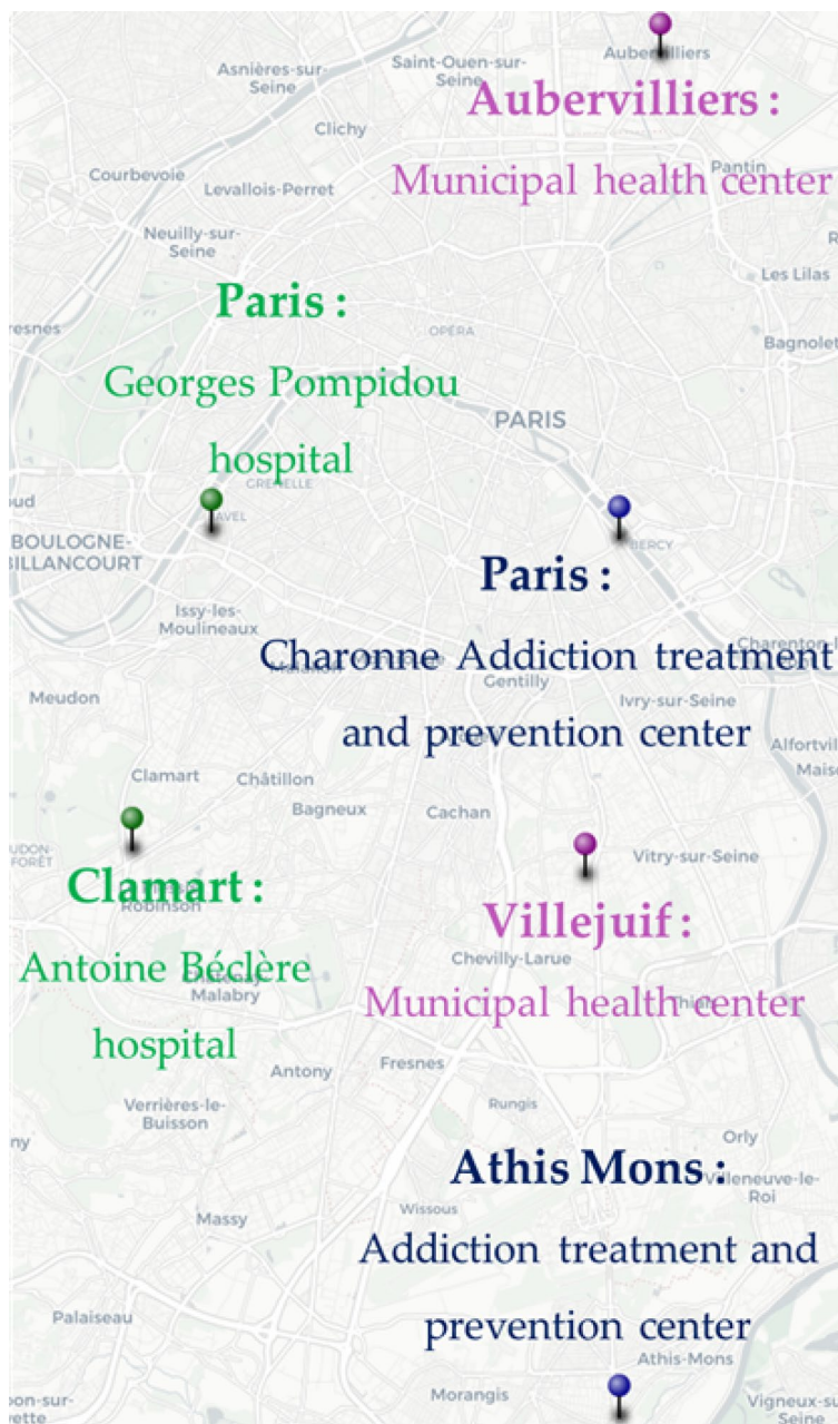
Fig. 1 : Participating centers in the STOP pilot study. 2018–2019

Persons Protections “Comités de Protection des Personnes”; N° CPP 2018–19-1).