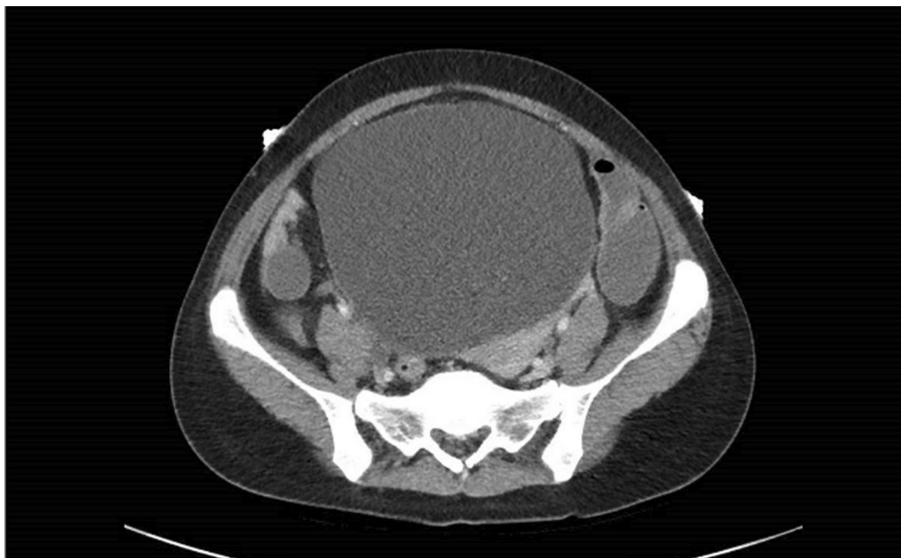
Fig. 1 Patient's abdomen/pelvis Computed Tomography (CT) with contrast showing urinary retention (axial view)

Inadequate pain management can lead to obstructed defecation and urinary retention [9, 10]. Balancing the use of opioids to optimize analgesia while not inducing constipation and urinary retention is important [2]. Both