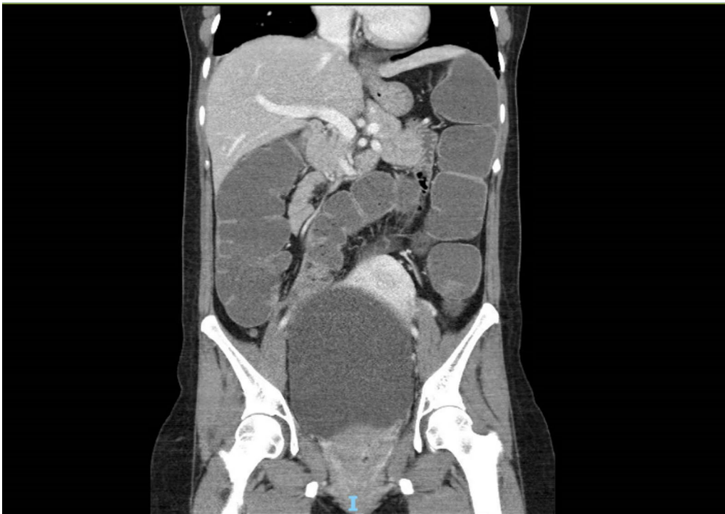
Fig. 3 Patient's abdomen/pelvis Computed Tomography (CT) with contrast showing dilated large bowel with transition point within the pelvis in the distal sigmoid colon, likely secondary to extrinsic compression from the distended bladder resulting in mechanical large bowel obstruction (coronal view)