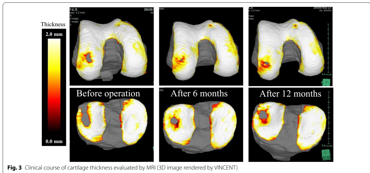
Fig. 3 Clinical course of cartilage thickness evaluated by MRI (3D image rendered by VINCENT)