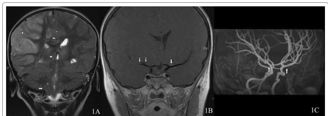
Fig. 1 A Coronal T2 showing diffuse cortical swelling with T2 high signal intensity involving a large portion of the right cerebrum (star) along with a subsequent midline shift to the left, right uncus, right subfalcine, and tonsillar herniation (arrows). B Vessel wall image showing mild vessel wall enhancement involving the middle cerebral arteries (arrows). C Magnetic Resonance Angiography (MRA) showing minimal irregularity involving the M1 and M2 segments of both the middle cerebral arteries (arrows)

decompressive hemicraniectomy, with intraparenchymal ICP monitor insertion. A simultaneous brain biopsy and right upper abdomen quadrant implantation of a bone flap was also performed. Intraoperatively, the ICP ranged from 30 to 35 mmHg. The patient was shifted back to the PICU, where medical therapy and treatment of elevated ICP were continued, with a target ICP < 20 mmHg, which was successfully achieved 17 hours later by a thio-pental-induced coma. Histopathology showed neutrophil vacuolation. There were few mitotic figures in the white matter and gliosis with prominent clasmotodendrosis.