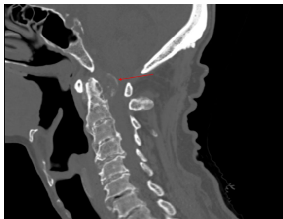
Fig. 1 Sagittal computed tomography of cervical spine revealing a large, retrodental calcific mass following the contour of the transverse ligament of atlas, causing severe spinal canal stenosis. The radiographic finding is highlighted by the arrow

Computed tomography (CT) of the cervical spine revealed significant arthritis with ankylosis of the mid-cervical spine. Atlas and axis revealed rat-tooth erosions with a large retrodental mass appearing to arise from the transverse ligament of the atlas, containing calcific deposits and causing cord compression, with approximately 80% spinal canal stenosis (Figs. 1, 2). The radiologist advocated that the CT depiction was consistent with