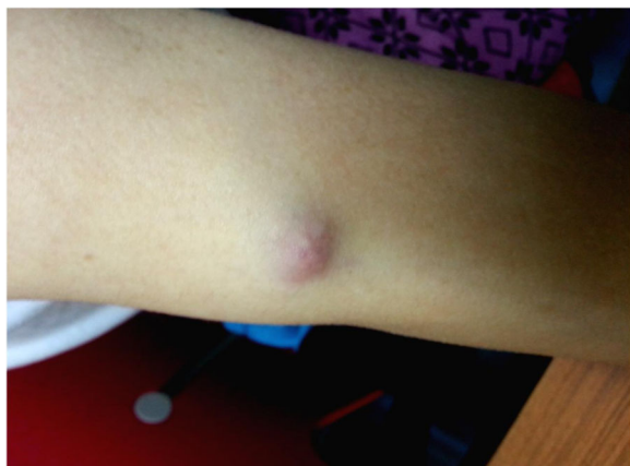
Fig. 1 Cutaneous metastatic nodule in the upper extremity

Computed tomography of her chest, abdomen, and pelvis, and a whole body bone scan revealed multiple lung, liver, and bone metastases. She died after two