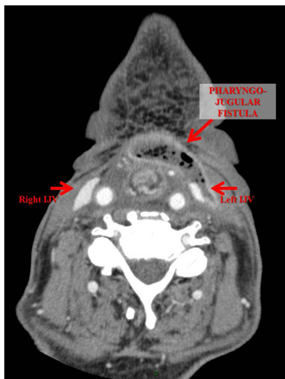
Fig. 1 Neck computed tomography (axial view) showed the presence of a fistula between the left internal jugular vein and pharynx