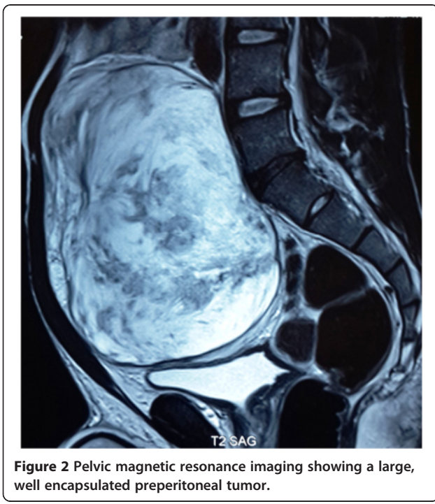
Figure 2 Pelvic magnetic resonance imaging showing a large, well encapsulated preperitoneal tumor.

Surgical resection was decided by the multidisciplinary meeting for cancer care. Exploratory laparotomy revealed a well encapsulated elastic soft tumor in the preperitoneal space. Upon incision of the linea alba, there was a protrusion of the mass. It was easily cleaved before the opening of the anterior parietal peritoneum. At the end of excision, there was a peritoneal break due to size of the mass (Figure 3).