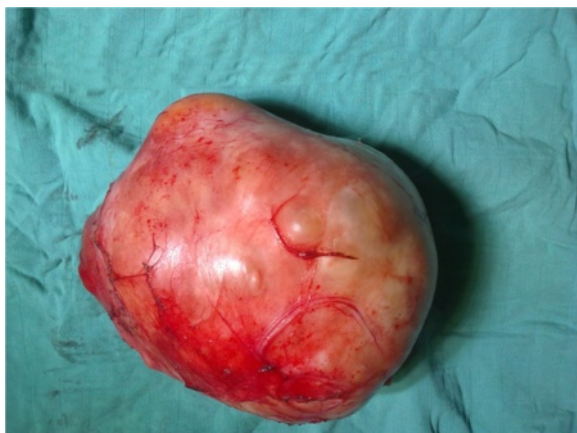
Figure 4 Macroscopic appearance of the preperitoneal neurofibroma; size = 17x18cm, weight = 2 kg.

and systemic symptoms present in the disseminated neurofibromas are absent in the solitary type [7].