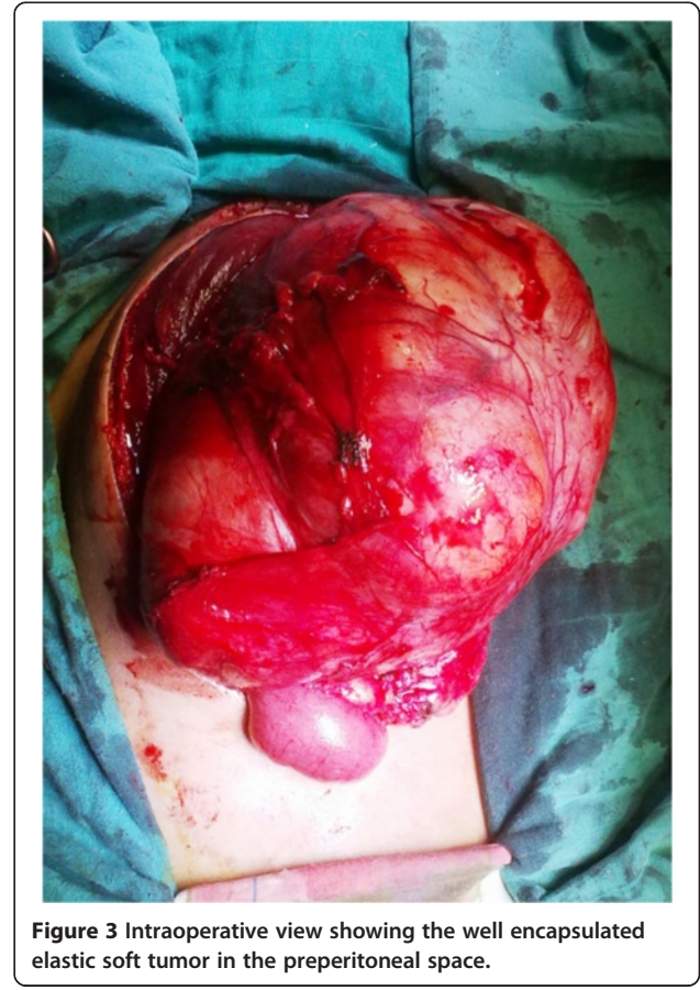
Figure 3 Intraoperative view showing the well encapsulated elastic soft tumor in the preperitoneal space.

Neurofibroma is a tumor of neural origin derived from the cells that constitute the nerve sheath. It's an uncommon benign tumor found as a solitary tumor or as a partial manifestation of neurofibromatosis type I (NF1, also called von Recklinghausen's disease) [2]. The cause of solitary neurofibroma is still unknown [3], it is defined by Marocchio et al. [4] as a hyperplastic hamartomatous malformation rather than neoplastic. NF1 is an autosomal dominant genetic syndrome caused by mutations in genes coding for neurofibromin [5], it is characterized by cutaneous manifestations as cafe-au-lait spots with a large number of nervous system tumors [6]. The hereditary factors