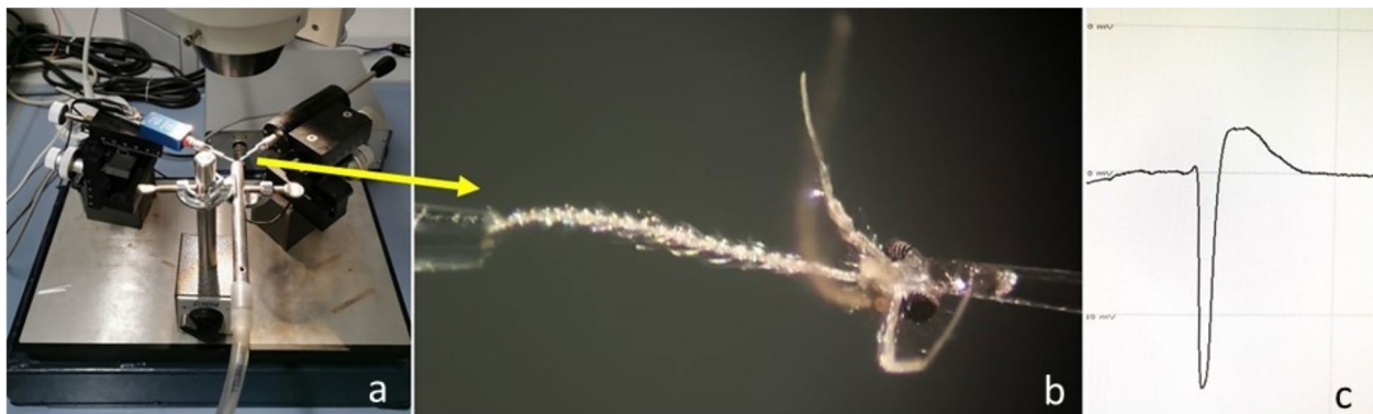
Fig. 2 Electroantennography for the evaluation of sand flies chemoreceptivity to VOCs