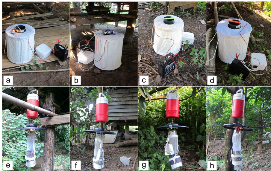
Fig. 2 Trap setting. a BGS trap with incandescent bulb. b BGS trap with UV LED. c BGS trap with green light stick. d BGS trap with red light stick. e CDC LT with incandescent bulb. f CDC LT with UV LED. g CDC LT with green LED. h CDC LT with red LED