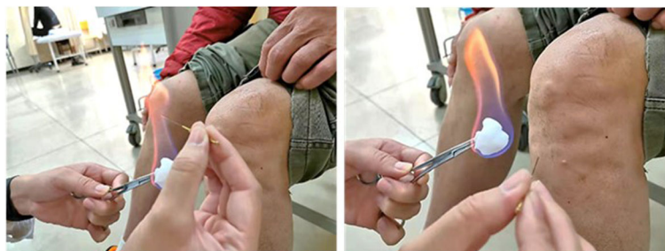
Fig. 2. Fire needle

Adverse reactions related to acupuncture include pain, fainting, bleeding, hematoma, infection, nerve injury, aggravation of an underlying disease, severe skin allergy, stuck needle (i.e., the therapist feels sluggish and astringent under the needle and has difficulty twisting, lifting, and inserting the needle, and the patient feels pain during the acupuncture process [19]), a bent needle, and a broken needle. The classification of adverse events refers to adverse drug reactions: level 1—safe, without any adverse reactions; level 2—relatively safe. If there are adverse reactions, the participants can be treated sequentially without any treatment of the complication; level 3—there are safety problems and moderate adverse reactions. The participants can continue to