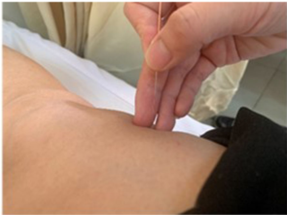
Fig. 3. Filiform needle

receive treatment after the reactions have been taken care; and level 4—the treatment was terminated due to the adverse reaction. Constitutional or local symptoms, signs, and adverse reactions will be dynamically observed and recorded, which will be used for comprehensive analysis.