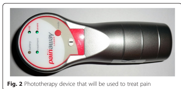
Fig. 2 Phototherapy device that will be used to treat pain

for the treatment of tender points of the patients with FM [25]. The protocol consists of stretching and aerobic exercise two times per week for 10 weeks. Active static stretching will be applied to the following muscle groups: biceps, trapezius, latissimus dorsi, pectoralis,