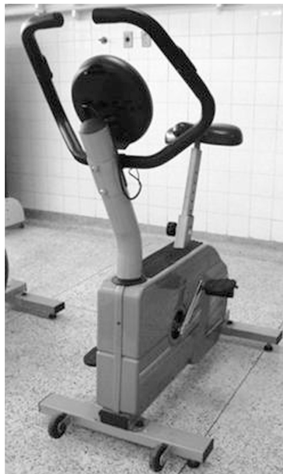
Figure 2 Photograph of the cycle ergometer.

Under the guidance of a physical therapist, group I will perform cycle ergometer exercises on a vertical, stationary cycle ergometer, Dyanmond line, Uniforce Fitness, Dy, model EB 497E (contato@uniforcefitness.com.br) (Figure 2) and conventional exercises and group II will perform conventional exercises alone. Ergometer resistance will be minimal (30 W) because the aim is not to perform cardiac exercise. The duration of ergometer cycling will be increased gradually, starting with 10 minutes in the first 2 sessions and increasing to 20 minutes for the remainder, and its aims are to improve coordination, proprioception, ROM, and muscle strength. For this reason, changes are not made during performance of the exercise; frequency is maintained at