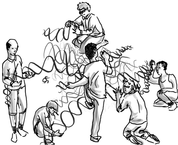
Figure 2 Different researchers studying the same data may arrive at discordant conclusions. Benchmarking becomes essential as a way to separate true findings from spurious ones. (Illustration by Natasha Stolovitzky-Brunner© inspired by the parable of the six blind men and the elephant).

be ameliorated by gamifying the problem, that is, using game tools that require puzzle solving or geometric thinking to engage users in genomics problems [26,27]. Gamification may not be possible or appropriate, however, because it may require sacrificing domain-specific prior knowledge that is essential to the correct solution. Third, the size of the raw genomic data necessary to perform these