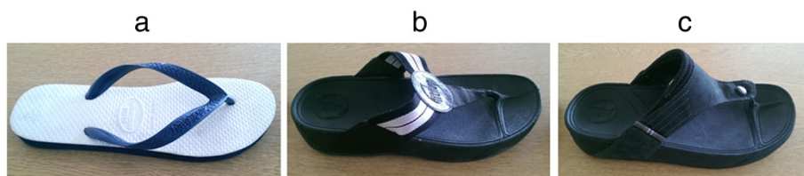
Figure 1 Footwear conditions tested: Havaiana flip-flop (a), Female FitFlop, Walkstar I (b) and Male FitFlop, Dass (c).