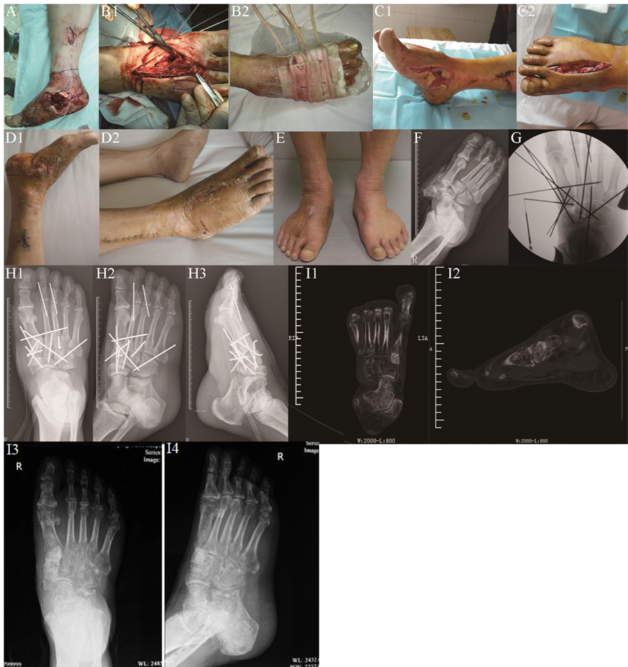
Fig. 1 Male patient, aged 55, with right foot severe open Lisfranc fracture-dislocation, was admitted to hospital 2 h after being crushed under heavy objects. One-stage internal fixation using k-wires associated with VSD was performed during emergency. a Severe open wound on the right foot with Lisfranc fracture-dislocation and badly contaminated, combined with ankle fracture shown on X-ray film. b One-stage reduction and multiple k-wire internal fixation were performed via the open wound and dorsal incision, sealed with VSD kit. c The condition of original wound and incision was checked when VSD kit was changed 5 days after surgery. d The patient was discharged from hospital 23 days after surgery, when the dorsal incision recovered well after suture, and the original open wound also recovered well after postage stamp grafting. e One year after injury and 8 months after weight-bearing walking, with satisfying appearance and function. f On X-ray film before surgery, fracture-dislocation was observed to the right Lisfranc joint, combined with distal fibula fracture. g Multiple k-wire cross-fixation was performed during surgery; the fracture-dislocation reached to anatomical reduction under X-ray. h AP, oblique, and lateral X-ray showing the condition of fracture-dislocation after one-stage internal fixation with good alignment. i Space broadening was not observed by CT review and X-ray film half a year after removing internal fixators