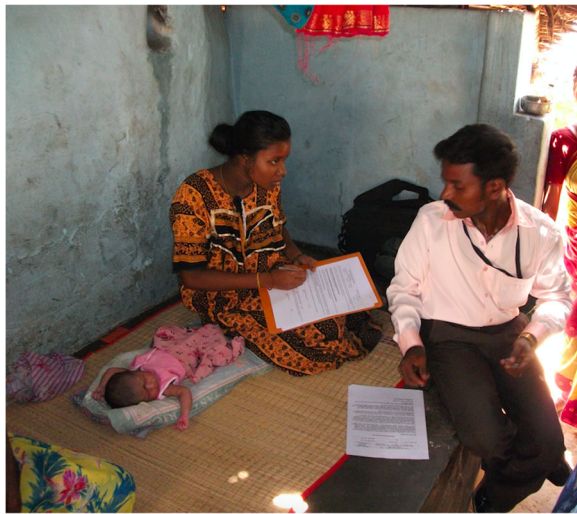
Fig. 1 Field research assistant interviewing mother about feeding practices

sociodemographic variables such as gender, birth-weight, mother's age, and socioeconomic status were selected to fit the model. For survival analysis and Cox proportional hazard analysis, children were censored on the day on which they were lost to follow-up or the last valid interview was missed.