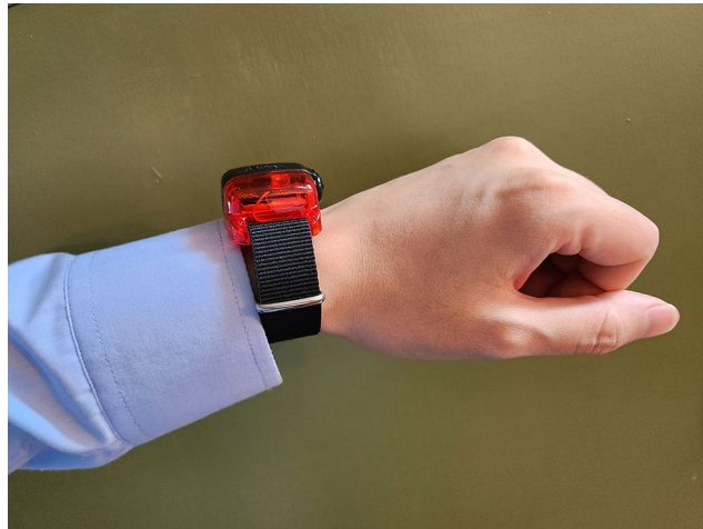
Fig. 2 Actigraph wGT3X-BT (ActiGraph, Florida, USA)