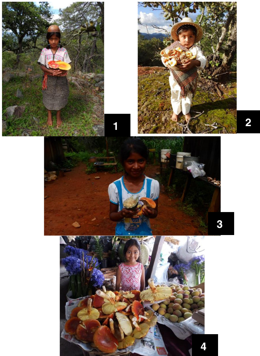
Fig. 4 Gathering of wild edible mushrooms by Mixtec children in “Mixteca Alta Oriental” of Oaxaca (1, 2, 3); collecting wild edible mushrooms by the population of the communities studied (4); marketing of A. aff. jacksonii in the market of the city of Oaxaca, Mexico (5)

to 2014, the accuracy of this belief was recorded. For the Mixtec peoples, rain ( savi or dau ) is the predominant meteorological phenomenon, and other phenomena are linked to it.