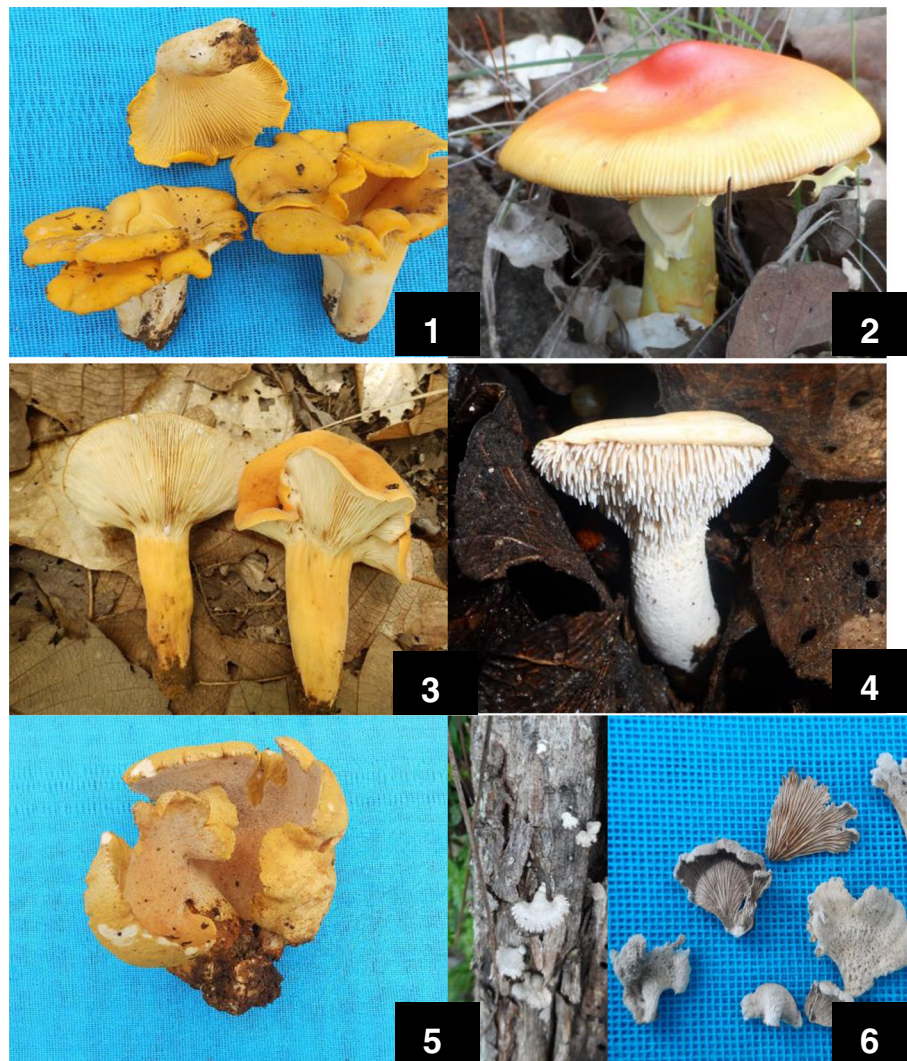
Fig. 3 Edible mushrooms in Santa Catarina Estetla and San Juan Yuta, state of Oaxaca, Mexico. 1. Cantharellus cibarius s. l.; 2. Amanita aff. jacksonii ; 3. Lactarius volemus ; 4. Hydnum repandum ; 5. Albatrellus aff. ovinus ; and 6. Schizophyllum commune

The nomenclature is based on the Index fungorum [36] and the ectomycorrhizal status in Rinaldi et al. [96] and Comandini et al. [97]. EL edible locally, L ludic, T toxic, DT deadly toxic, M mushroom, H humus, S soil, W wood debris, O other, G grassland, P Pinus forest (Mixed forests of Pinus oaxacana , P. lawsonii , P. michoacana , P. devoniana and P. pringlei ), Q Quercus forest (Mixed forests of Quercus magnoliifolia , Q. castanea , Q. urbanii , Q. rugosa , Q. laurina and Q. acutifolia ), P-Q forest of Pinus spp.- Quercus spp., TDF tropical deciduous forest, C crop, TG trophic group, EM ectomycorrhizal, MY mycoparasite, S saprobic. Mixtec community: 1: Santa Catarina Estetla; 2: San Juan Yuta; 3: San Miguel Tulancingo; 4: San Andrés Yutatío (numbers correspond to map in Fig. 1)