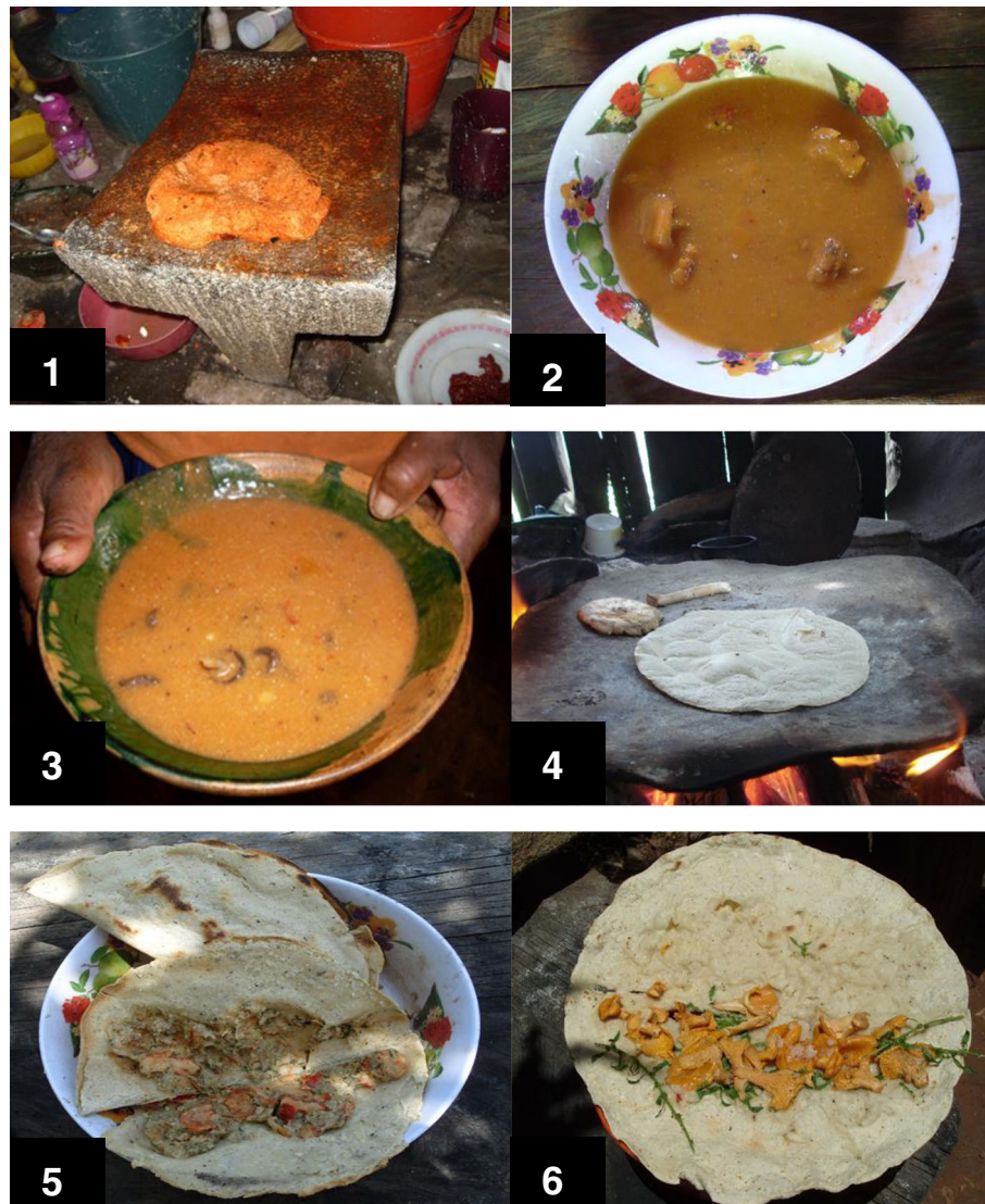
Fig. 5 Mixtec dishes with mushrooms: 1. Dough for mole "amarillito"; 2. mole "amarillito" with Cantharellus cibarius s. l. ; 3. mole "amarillito" with Marasmius oreades ; 4. A. aff. jacksonii roasted on the "grill"; 5. Empanada with Hypomyces lactifluorum ; 6. Quesadilla of Cantharellus cibarius s. l.

chindii , mushroom elf), which, because of their star shape, are collectibles (there is a challenge to find the most complete sporocarps and ones having different sizes). An advantage of this mushroom for ludic use is its durability. Also, informants reported that species of the genus Calvatia ( xi'i ndivi kuni , mushroom egg turkey hen) or Pisolithus ( xi'i ndivi burru , mushroom donkey testicle), when ripe, are used in children's games as projectiles ("snowballs") to throw at friends, siblings or grazing livestock. Undoubtedly, the natural curiosity of children represents potential and hope for the preservation and care of invaluable mycological resources for their ludic importance.