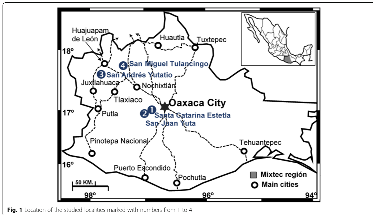
Fig. 1 Location of the studied localities marked with numbers from 1 to 4

The outstanding vegetation types in the communities of the study, following the classification of Rzedowski