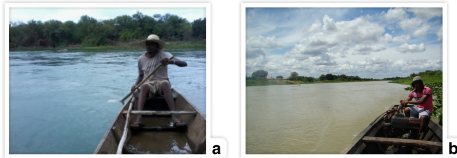
Fig. 3 Fishing canoe. (a) Paddle; (b) Diesel engine

decline of fishing stocks in the sub-middle São Francisco River. The introduction of exotic species in fresh water environments has been recognized as one of the greatest impacts to native species throughout the world [78–80]. In the case of the São Francisco River, several species have been introduced, and as indicated by the statements of the interviewees, these introductions have impacted the native species and caused changes in the traditional fishing activity of riverine populations. The species cited by the fishers included the butterfly peacock bass ( Cichla ocellaris ) and South American silver croaker ( Plagioscion squamosissimus ). These species were introduced to the Sobradinho Hydroelectric Plant Lake by the National Department of Works Against Drought (Departamento Nacional de Obras Contra as Secas-DNOCS) at the end of the 1970s [37]. In addition, many other species have been introduced species from fish farming experiments in the region, such as the oscar ( Astronotus ocellatus ) and tambaqui ( Colossoma macropomum ), generating