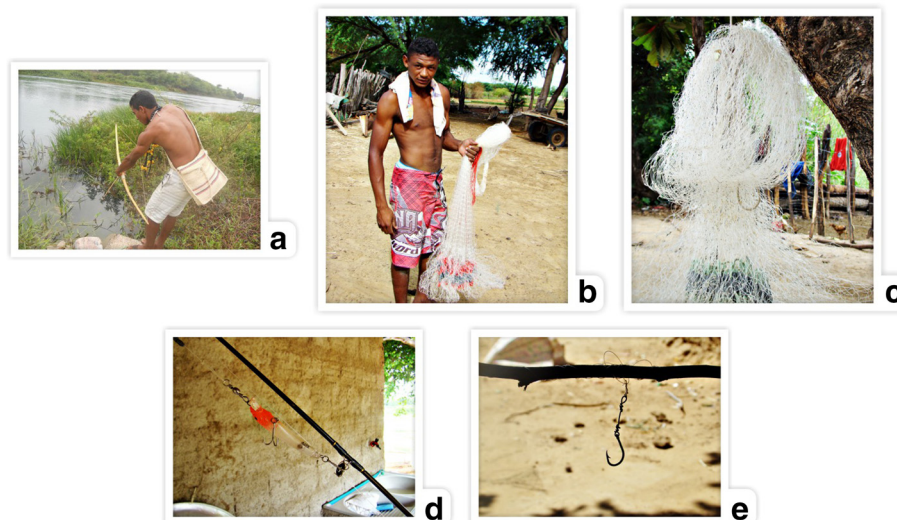
Fig. 2 Truká fishing techniques: (a) bow and arrow; (b) cast net; (c) net; (d) hook; (e) hand line

The fishers cited several problems that, according to them, have led to the decline of fishing in the villages surveyed. These problems include the growth of illegal fishing in the Truká territory by non-indigenous fishers, deforestation of the river banks, introduction of exotic species and pollution. These same factors were reported by Oliveira and Souza [36] to cause the