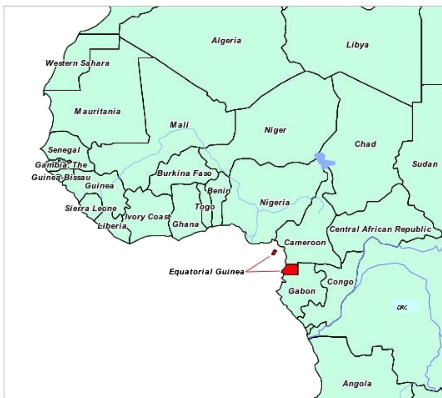
Figure 1 Map of Bioko Island and mainland Equatorial Guinea.

from 45% before the start of interventions to 14, 28 and 18% in 2012, 2013 and 2014, respectively; moderate to severe anaemia (Hb <8 g/dL) in two to 14 year old children declined from 15 to 2% between 2004 and 2014 and all-cause under-five mortality reduced from 152 per 1,000 births to 55 per 1,000 in the first four years post intervention [8]. A similar package of interventions was introduced on the mainland in 2007, but funding restrictions considerably limited their scope [10].