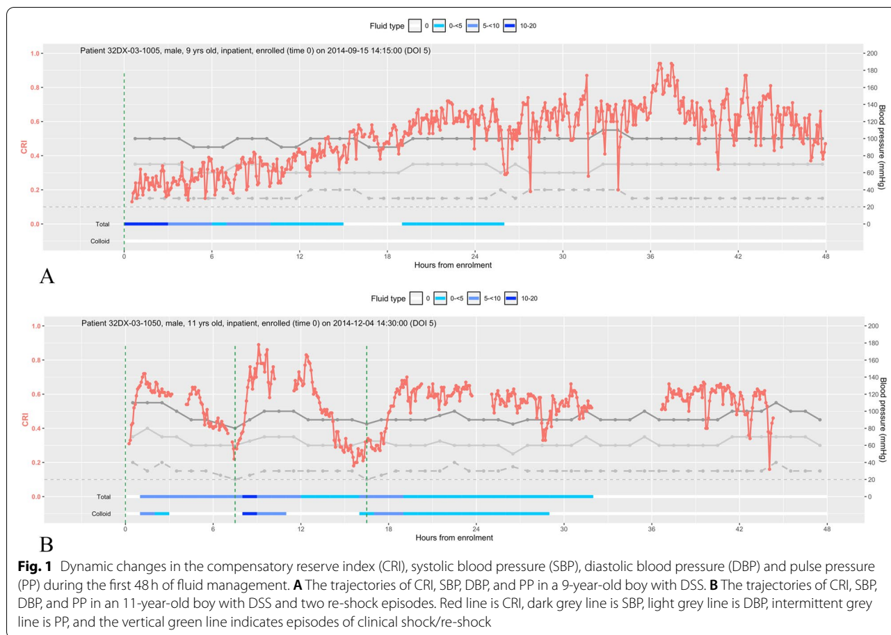
Fig. 1 Dynamic changes in the compensatory reserve index (CRI), systolic blood pressure (SBP), diastolic blood pressure (DBP) and pulse pressure (PP) during the first 48 h of fluid management. A The trajectories of CRI, SBP, DBP, and PP in a 9-year-old boy with DSS. B The trajectories of CRI, SBP, DBP, and PP in an 11-year-old boy with DSS and two re-shock episodes. Red line is CRI, dark grey line is SBP, light grey line is DBP, intermittent grey line is PP, and the vertical green line indicates episodes of clinical shock/re-shock

we show that the CRI had negative correlation with heart rate and systolic and diastolic blood pressure for the period of monitoring. As fluid leakage occurs in an individual, the CRI decrease is accompanied by a rise in heart rate, but also a rise in diastolic blood pressure due to compensatory vasoconstriction in the period prior to circulatory collapse. These results suggest that CRI could be a potentially helpful monitoring tool for the management of DSS in healthcare settings around the world, where obtaining contemporaneous vital signs, the assessment of intravascular volume of individual patients, and trending their responses to fluid resuscitation remain as