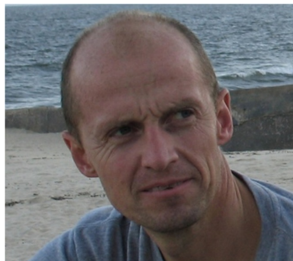
Fig. 8 Lorenz von Seidlein has worked for 20 years on malaria and other issues in global health. He worked in The Gambia on the first evaluations of ACTs in sub-Saharan Africa, and has managed several large vaccination projects. He is currently coordinating a major effort to eliminate malaria from areas with artemisinin resistance with the Mahidol Oxford Research unit in Bangkok, Thailand

The currently applied strategies towards malaria elimination mainly consist of vector control and case management. During the past century stringent implementation of these approaches has eliminated the disease in a number of countries ranging from Australia through the USA and reduced malaria to very low levels in many countries in Asia and Latin America [39]. As long as malaria therapy is efficacious and vector control measures work, continued and concerted efforts should slowly but steadily reduce further the burden of malaria. However, the current emergence of antimalarial and insecticidal resistance threatens to reverse these achievements in malaria control and increases the demand for interventions accelerating malaria elimination.