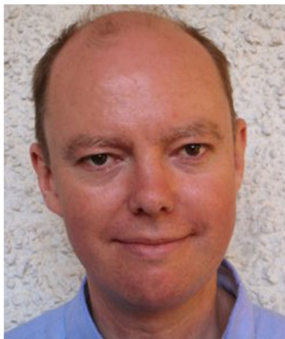
Fig. 3 Christopher JM Whitty is Professor of Public and International Health at the London School of Hygiene & Tropical Medicine (LSHTM), and Chief Scientific Advisor and Director of Research at the UK Department for International Development (DFID). He was previously director of the LSHTM Malaria Center and of the ACT Consortium

The debate around diagnosis for malaria elimination sometimes implies that the major issue is obtaining more sensitive diagnostic technology. Whilst improved