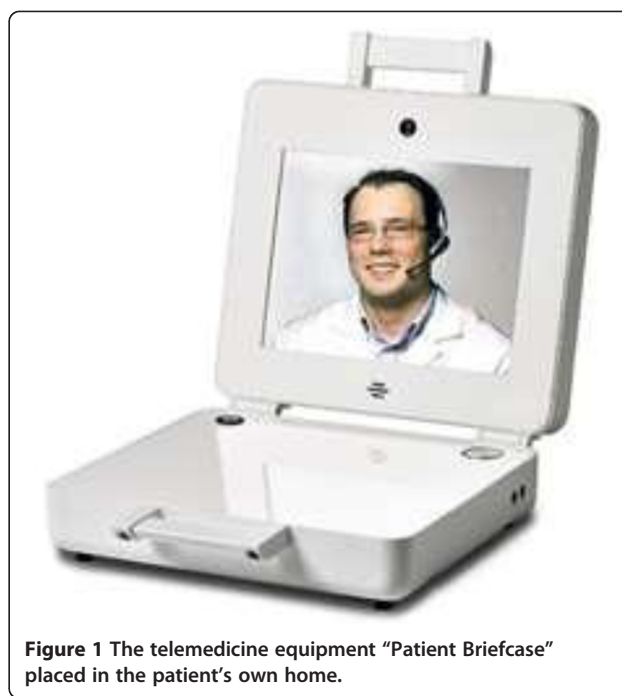
Figure 1 The telemedicine equipment “Patient Briefcase” placed in the patient’s own home.

The telemedicine videoconferencing equipment was designed to look like a briefcase and was known as the “Patient Briefcase”. The briefcase contained a screen, microphone, an on/off switch and a volume control (Figure 1). A camera was installed in the patient’s home together with the briefcase. The camera made it possible to follow the patients’ movements around the room during the training session. A pulse oximeter was used to monitor saturation and heart rate. The therapist’s equipment consisted of a computer with an in-built webcam and microphone, a second display for reading patient measurements and a computer for the electronic patient record. Communication took place via the internet (ADSL), wireless or satellite communication, and measurements were transferred from the patient’s home to the hospital in a closed secure system. Thus only invited users could participate in, view or hear the